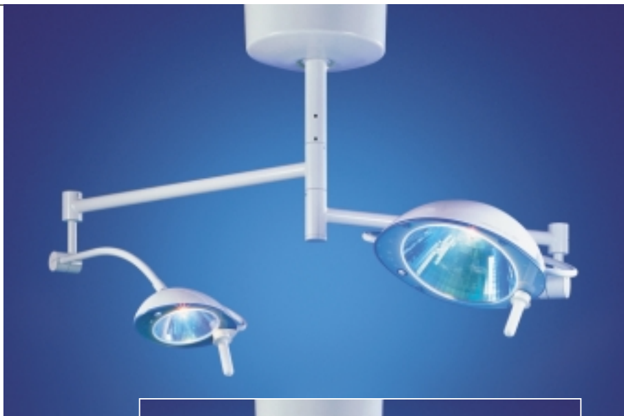
blue 80 / blue 30 – 80,000 / 30,000 lux