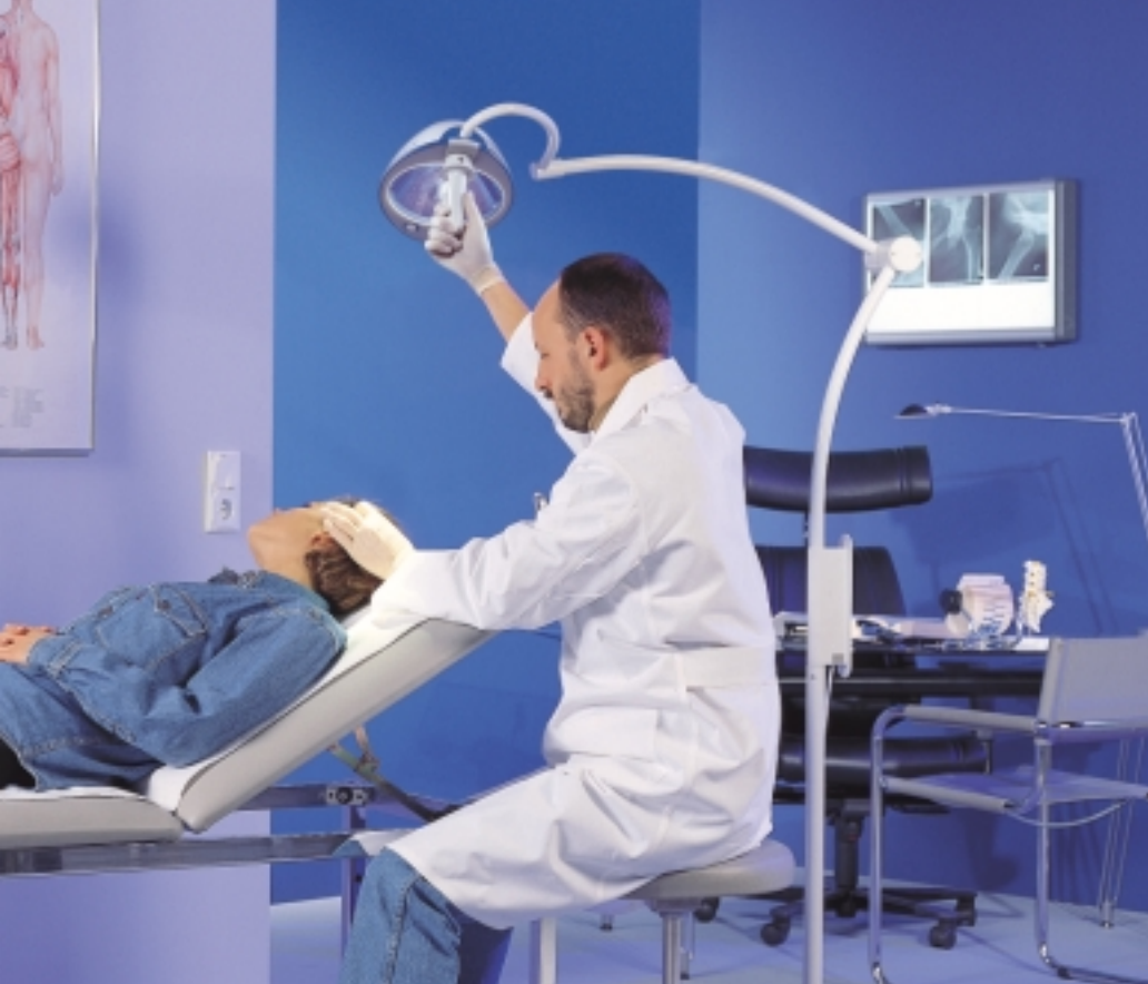
blue 30 S mobile – 30,000 lux