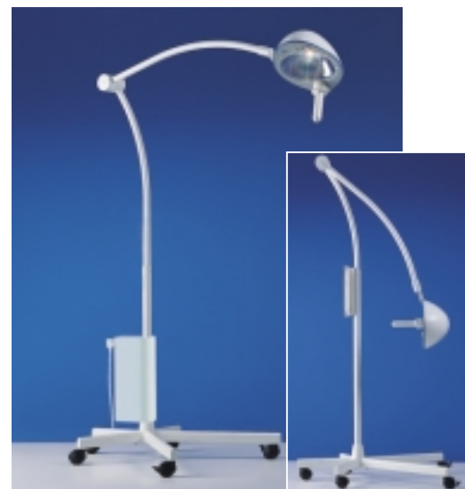
blue 30 S hospital – 30,000 lux with back-up battery

With many practical properties the HANAULUX blue 30 S/blue 30 models are an excellent addition to minor treatment rooms: mobile, hospital, wall or ceiling versions.