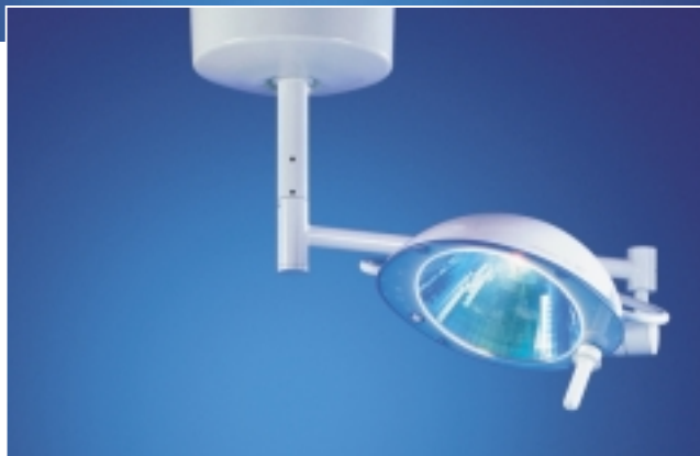
blue 80 ceiling – 80,000 lux