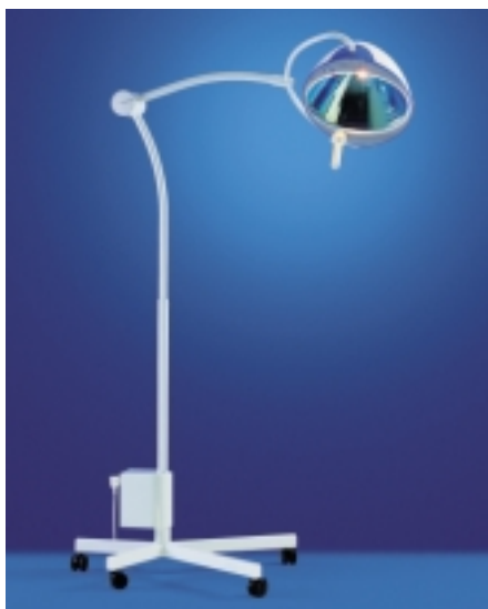
blue 80 free-standing – 80,000 lux