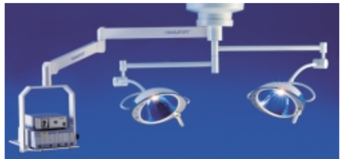
HANAUPORT with support arm system Alpha 2000: equipment carrier / blue 80 / blue 80