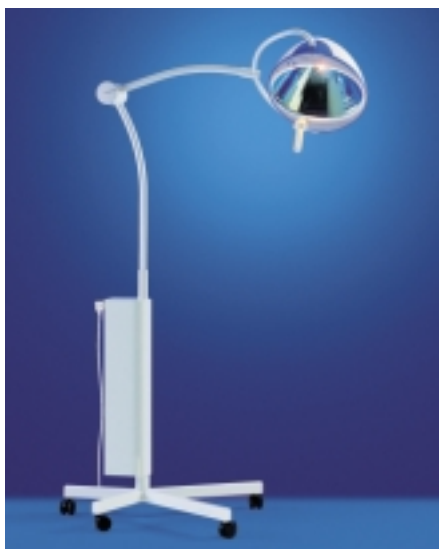
blue 80 hospital – 80,000 lux with back-up battery