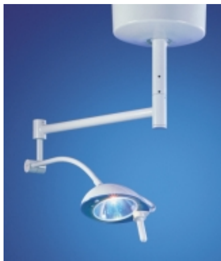
blue 30 ceiling – 30,000 lux