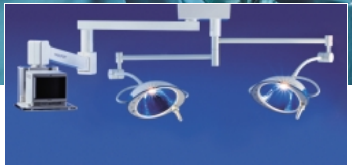
HANAUPORT with Tandem support arm system: Monitor / blue 80 / blue 80

Advances in surgical techniques call for new solutions in the operating theatre. Our answer: HANAUPORT with support arm system Alpha 2000 or the Tandem version.