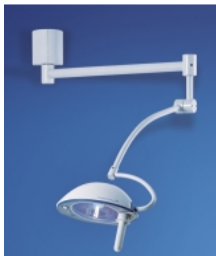
blue 30 wall – 30,000 lux