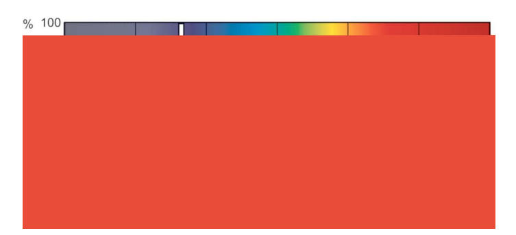
XDPB_XDMSR_SA-Spectral power distribution B/W